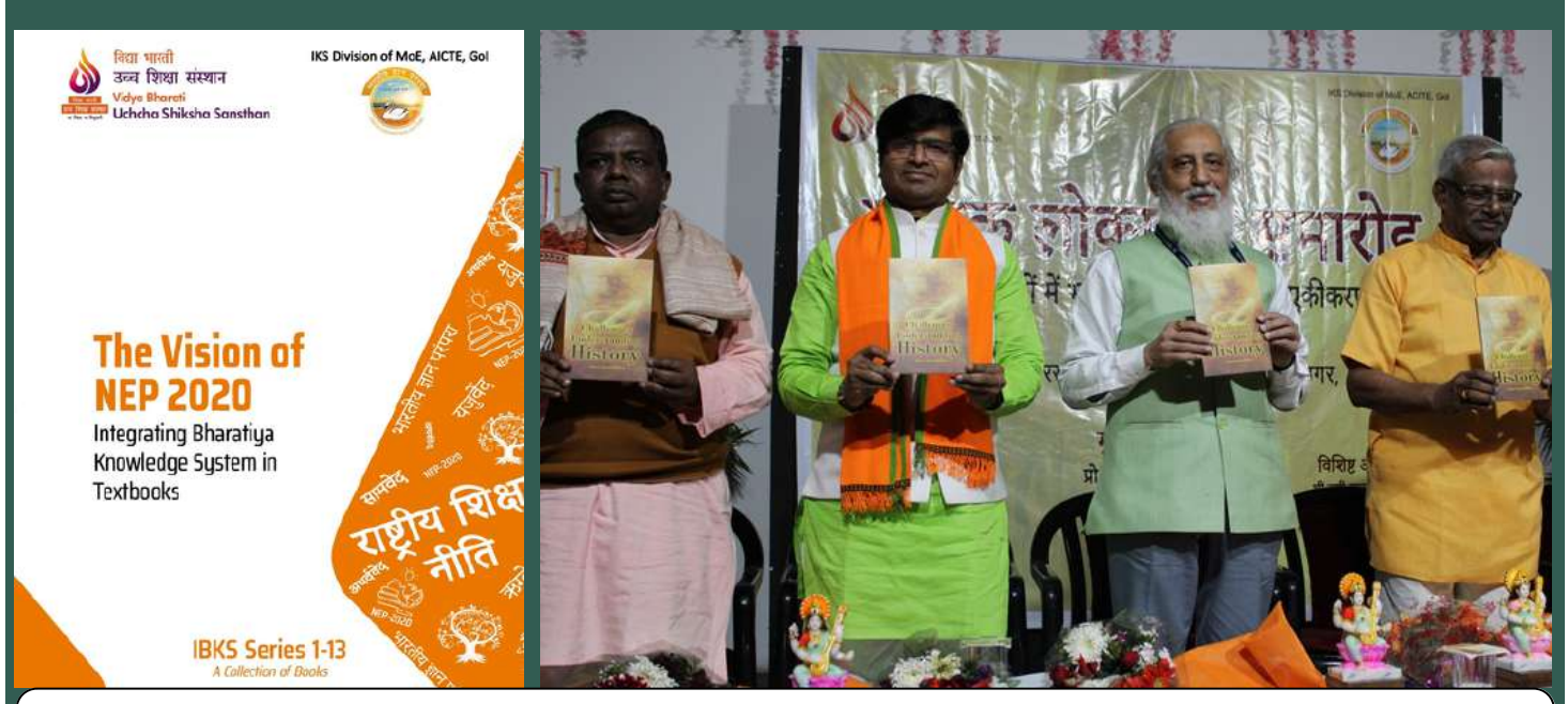
Bharat-Centric Education: Release of 13 Books